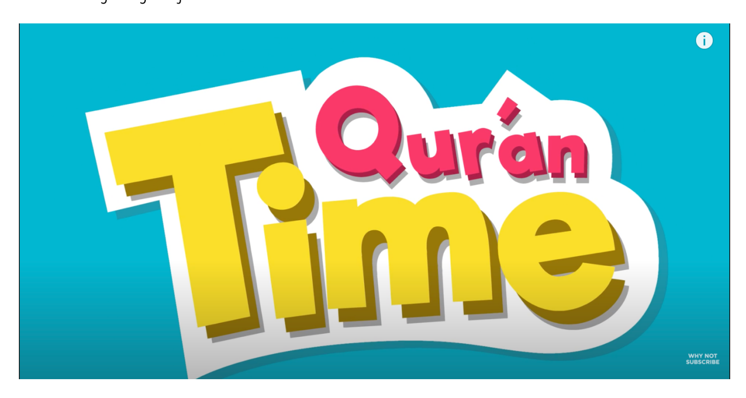
Task 2: Re-cap the noon-saakin and tanween rules.